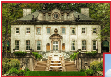
The Swan House