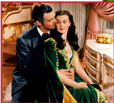
Gone With The Wind