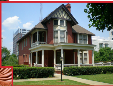
Margaret Mitchell House